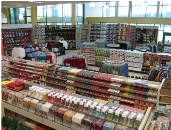
Above – Our Johnstown, RI Store

Aldi, Barnes & Noble, Bed Bath & Beyond, Best Buy, Big Y, BJ's Wholesale Club, Bob's Stores, CVS, Hannaford Bros Super Market, Home Depot, Home Goods, JC Penny, K-Mart, Kohls, Lowes, Marshalls, Michaels, Market Basket, Modells, Old Navy, Target, Petco, Price Chopper, Price Rite, Rite Aid, Save A Lot, Sears, Shaw's, Shop Rite, Staples, Star Market, Stop & Shop, Target, TJ Maxx, Tractor Supply Company, Walgreens, Wal-Mart & More