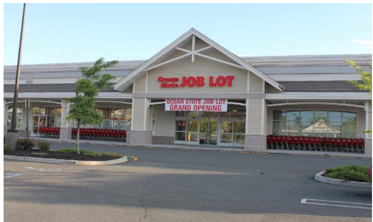
Above – Our Store in New City, NY.

Ocean State Job Lot is the North East’s “Home of Adventure Shopping”. Millions of Job Lot customers enjoy hunting for quality brand name merchandise at closeout prices. Ocean State Job Lot opened for business in 1977 as a single store operation in North Kingstown, RI. The concept was to sell brand name, first quality products at closeout prices. We understood that people work hard for their money. Our job was to deliver the best values possible. That was the concept then and that's still our goal today.