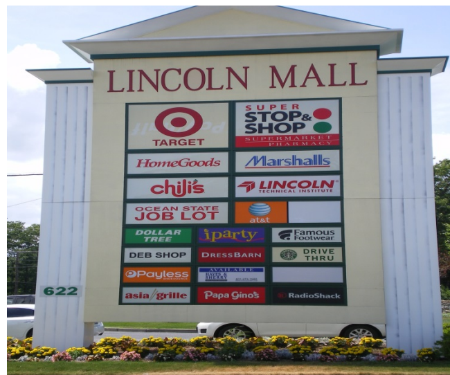
Above – The Shopping Center Pylon sign in our Lincoln, RI Location