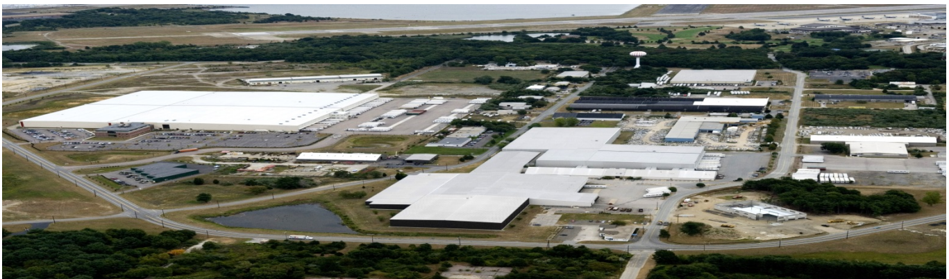
Above – Our Corporate Headquarters and Distribution Center in North Kingstown, RI opened in 2004 with the first DC addition being completed in 2007. The facility consists of 36,000 square feet of office space and 700,000 square feet of warehouse space. In total Job Lot currently occupies 1.2 million square feet of warehouse space in North Kingstown, RI.

To Submit a Site and To See All of Our Available Surplus Properties Please Visit: